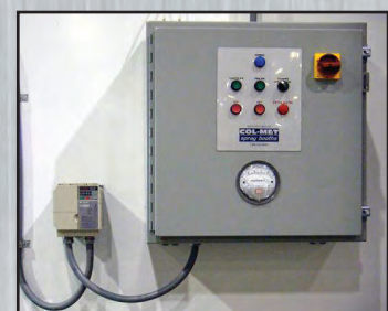
Control panel and VFD included