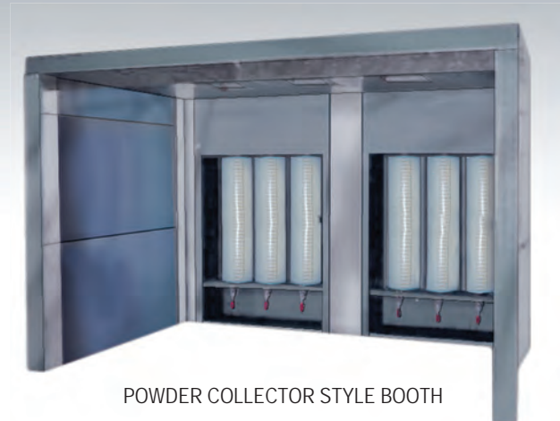
POWDER COLLECTOR STYLE BOOTH