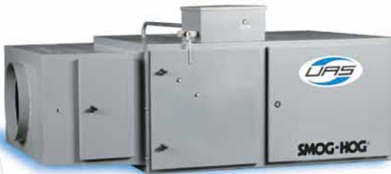
SHN-20 with optional inlet plenum

...equipped with airflow capacities ranging from 400 to 9,000 CFM.